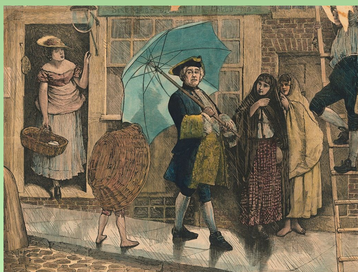
Figure 2: Jonas Hanway and his umbrella (Waters 2016).

An 18th century traveler and writer, Jonas Hanway, brought an umbrella home with him after traveling the Middle East and Asia, believing that they'd be perfect for the damp London weather. Unfortunately for Hanway, his adaptation of the umbrella didn't immediately take off as a fashionable accessory and he was often mocked for the oversized version that he carried with him around London (see Figure 2) (Olmert 1996:254-255; Waters 2016).