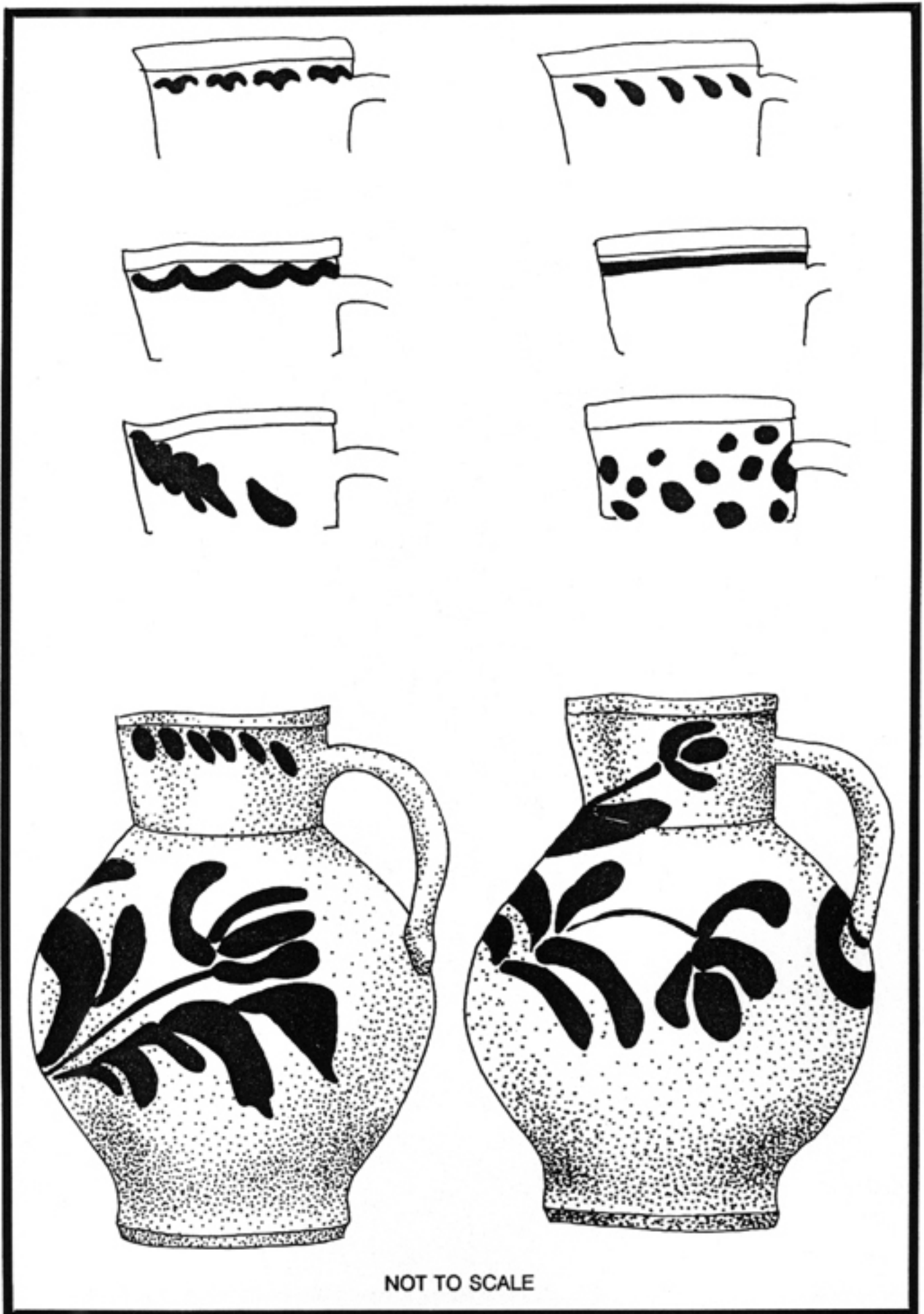
Figure 29 Drawing of reconstructed pitcher decorations from the Pawley assemblage